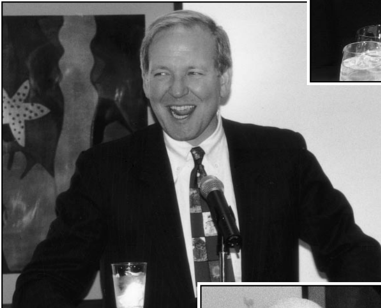
◀ Speaker Michael D. McCurry, former Assistant to the President and Press Secretary, at the December 16, 1998, Annual Daughters and Sons Event, "A View from the Mike."