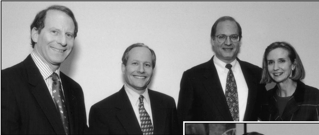
▲ Speakers Richard N. Haass, Director of Foreign Policy Studies, Brookings Institution, William Kristol, Chairman, Project for the New American Century, Presider Vin Weber, and Paula J. Dobriansky at the February 17, 1999, Meeting, "Is There a Republican Party Foreign Policy?"

► Speakers Stephen J. Solarz, former Member, U.S. House of Representatives, and Principal, Solarz Associates, and Winston Lord, former U.S. Ambassador to China and former Assistant Secretary for East Asian and Pacific Affairs, U.S. Department of State, at the November 17, 1998, Eyewitness to History Meeting, "The 1979 Taiwan Relations Act: Is It Still Relevant for U.S. Policy?"