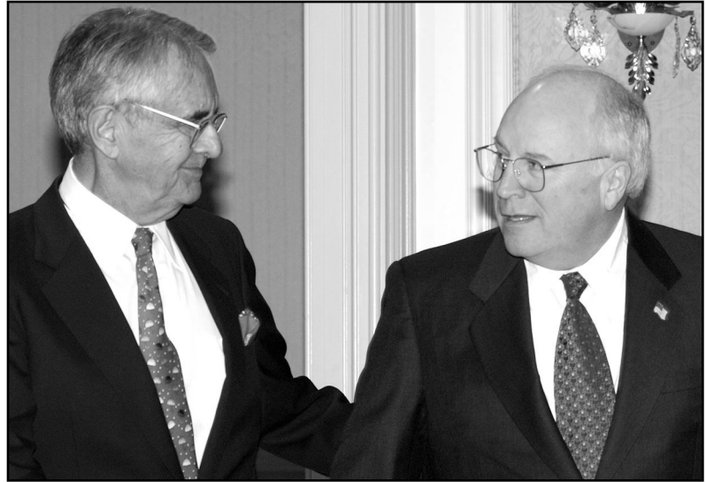
Peter G. Peterson and Speaker Dick Cheney, Vice President of the United States, at the February 15, 2002, "Launch of the Maurice R. Greenberg Center for Geoeconomic Studies."

I am particularly pleased to have the opportunity to work closely with two incredibly talented and dedicated vice chairs, Carla A. Hills and William J. McDonough.