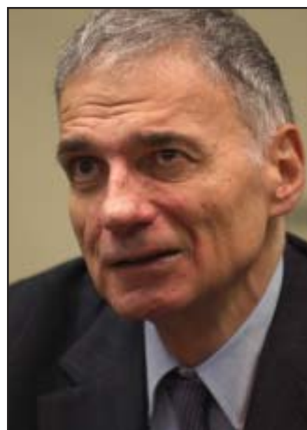
Independent presidential candidate Ralph Nader.