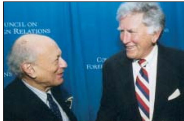
Arthur Ross with Gary Hart at the Arthur Ross Book Award event.