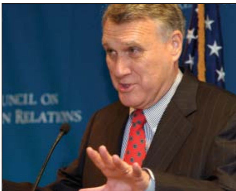
Senator Jon Kyl (R-AZ) discusses Iraq and intelligence one week after Senator Edward M. Kennedy (D-MA) gave a foreign policy address to Council members.