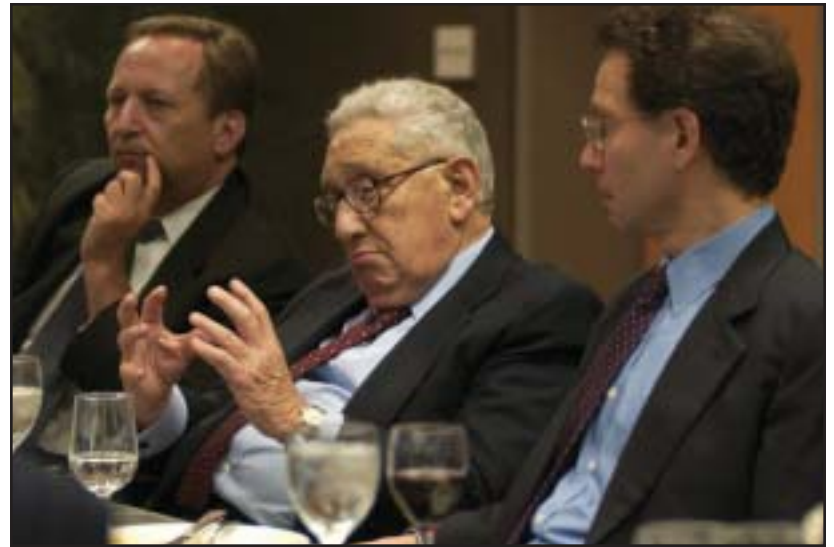
Transatlantic Relations Task Force Co-Chairs Lawrence H. Summers and Henry A. Kissinger and Task Force Director and Council Senior Fellow Charles A. Kupchan meet with journalists to discuss the Task Force’s findings.

The Independent Task Force on Iraq, co-chaired by Thomas R. Pickering and James R. Schlesinger, released in March 2004 a “one year later” update to its 2003 report, calling on the Bush administration and the presumptive Democratic nominee to reaffirm Washington’s commitment to security and reconstruction in Iraq. The Task Force recommended that the United States declare that coalition forces will continue to provide essential security in Iraq until the Iraqi security forces can do so on their own; emphasize that the transfer of sovereignty does not signal a diminished U.S. commitment to supporting stability, reconstruction, and a peaceful political transition; affirm that it is prepared to sustain a multi-billion-dollar commitment to Iraq for at least the next several years; and ensure the broad involvement of Iraqis and a leading role for the United Nations in the political transition in Iraq.