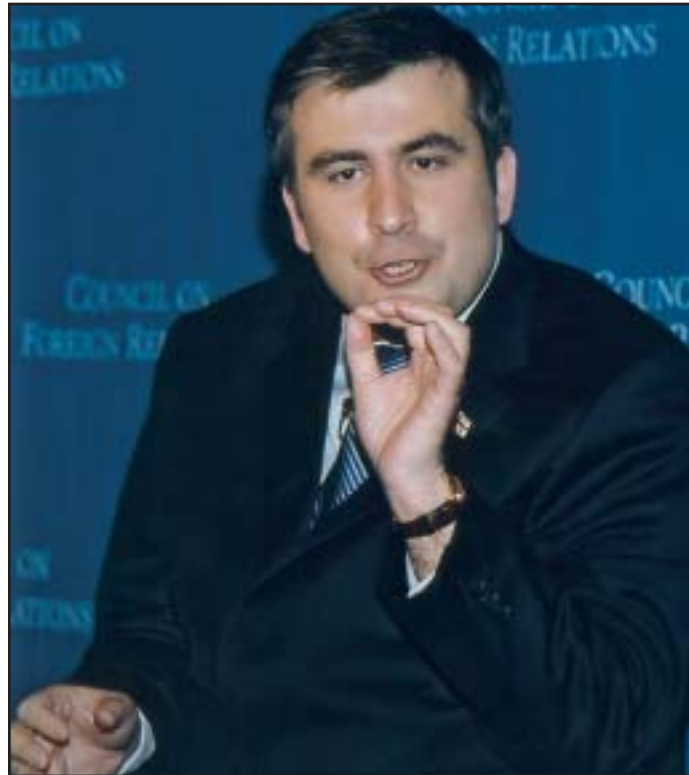
President Mikhail Saakashvili of the Republic of Georgia speaks to Council members.

The Council's Africa program also prepared two Special Reports, both released in May. The first, Addressing the HIV/AIDS Pandemic: A U.S. Global AIDS Strategy for the Long Term , cosponsored by the Mil-