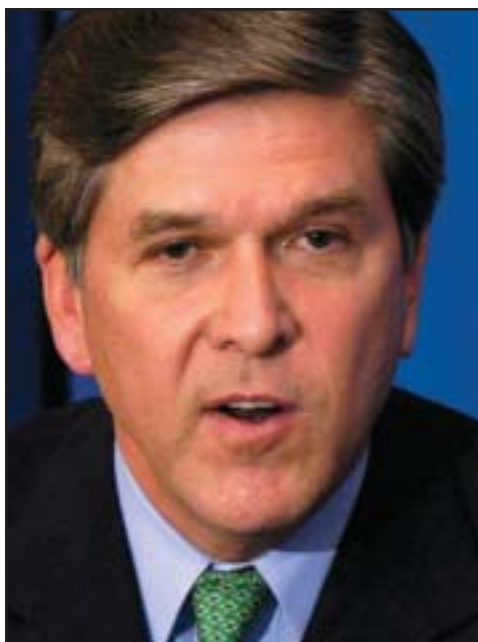
Senators Gordon H. Smith (R-OR) and Joseph R. Biden Jr. (D-DE) face off in the first of the Council’s debates between leading Republicans and Democrats.