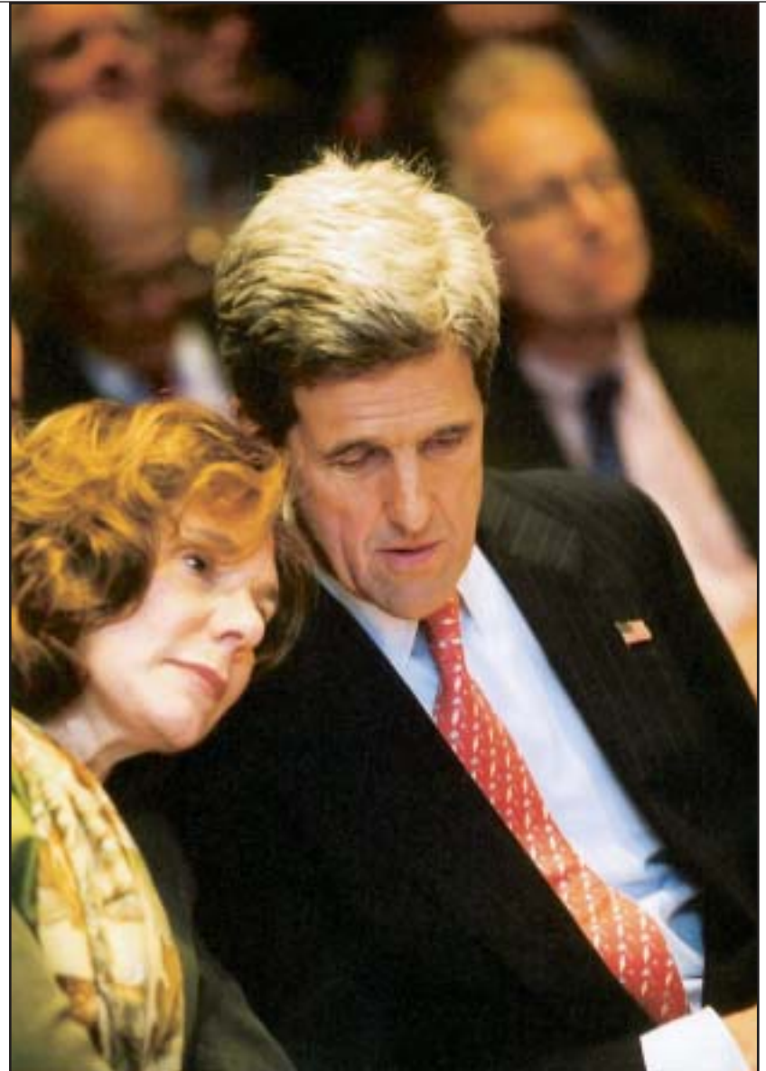
Teresa Heinz Kerry and John F. Kerry.

subtext of many more). Throughout the year, journalists, pollsters, and scholars gave participants a tour of the ever-changing political landscape. As the conventions neared, the Council's Washington Program inaugurated a series of head-to-head debates between leading Republicans and Democrats. The first took place in mid-May, when Senator Joseph R. Biden Jr. (D-DE) faced off against his colleague Senator Gordon H. Smith (R-OR).