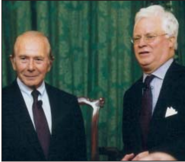
Council Honorary Vice Chairman and Board Director Maurice R. Greenberg with then CIA Deputy Director for Operations James L. Pavitt.