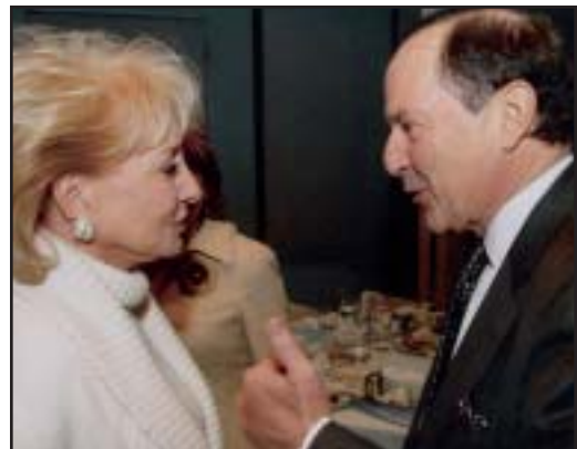
Barbara Walters of ABC News with U.S. News and World Report Editor Mortimer B. Zuckerman.