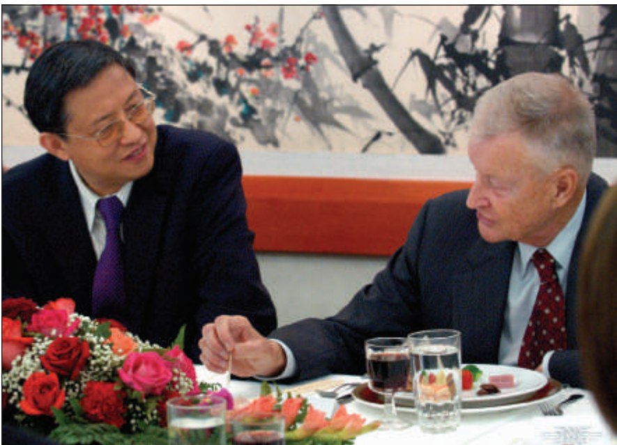
Zhou Wenzhong, ambassador of China to the United States, with Zbigniew Brzezinski, counselor at the Center for Strategic and International Studies and former national security adviser, at a discussion of U.S.-China relations as part of the Washington Program's Embassy Lunch Series.

The nation's capital provides a unique backdrop for the Council's Washington Program to undertake a rich variety of programming and outreach. Whether in small group settings that function as a laboratory of sorts for new foreign policy thinking, or in large Council meetings where the issues of today—and tomorrow—are discussed, the Washington Program is cementing its reputation as the place for intensive, deliberative, and fruitful discussions on foreign policy. By bringing together representatives from Congress, the administration, the diplomatic corps, and the business community with opinion leaders and Council members, and by drawing on the Council's robust intellectual resources, the Washington Program is facilitating conversations and building relationships to bridge partisan gaps and foster a vibrant and effective foreign policy debate.