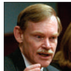
Deputy Secretary of State Robert B. Zoellick

critical areas where science and foreign policy intersect and explore the implications of emerging technologies on trade, security, U.S. competitiveness, and global health. The initiative, begun in the 2004–2005 program year, has held fourteen meetings in Washington, including seven during this program year. Highlights include meetings on the ways in which new technology is changing the intelligence community, terrorist use of the Internet, and China’s growing clout in high technology.