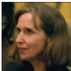
Undersecretary of State for Democracy and Global Affairs Paula J. Dobriansky