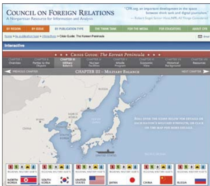
CFR.org launched its Crisis Guides with this information-rich, interactive guide to the Korean conflict.

The data shows that CFR.org’s traffic has increased, and anecdotal evidence suggests the website’s influence has grown as well. CFR.org content appears near the top of common Google searches such as “Hamas” and “Hezbollah,” making the material readily accessible. Furthermore, journalists and members of gov-