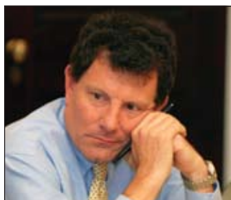
ABC News correspondent Cynthia McFadden and New York Times columnist Nicholas D. Kristof at a press briefing on the report of the Independent Task Force on U.S.-China Relations.