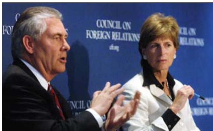
Rex W. Tillerson and Council Board member Christine Todd Whitman at the Corporate Conference closing lunch.