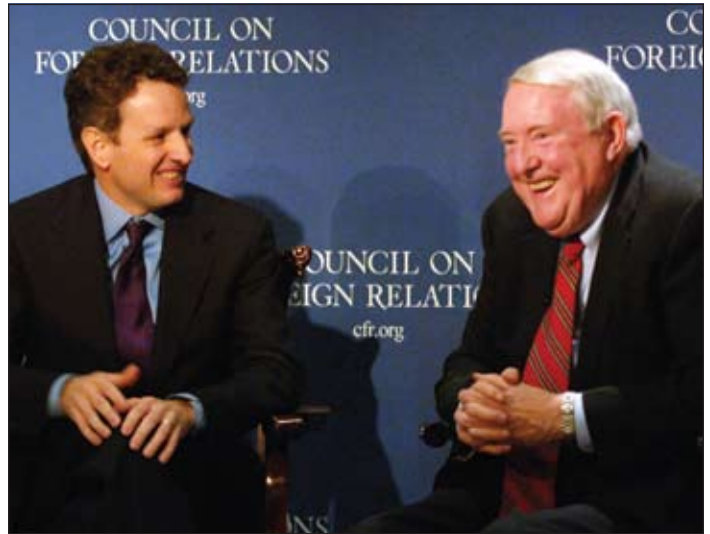
Timothy F. Geithner and E. Gerald Corrigan at a meeting in the C. Peter McCoolough Roundtable Series on International Economics.

For the third year in a row, one of the highlights of the program year was the annual Corporate Conference, held March 8–9, 2007, in New York City. The conference explored the forces shaping the future “beyond the next quarter,” and included four concurrent scenario-based sessions each day. The conference closed with a discussion with the chairman and CEO of ExxonMobil, Rex W. Tillerson , moderated by Council Board member and former Environmental Protection Agency administrator Christine Todd Whitman . Other topics discussed over the two days were the economic view from abroad and the view from Washington as a new Congress took over and the 2008 presidential campaign began.