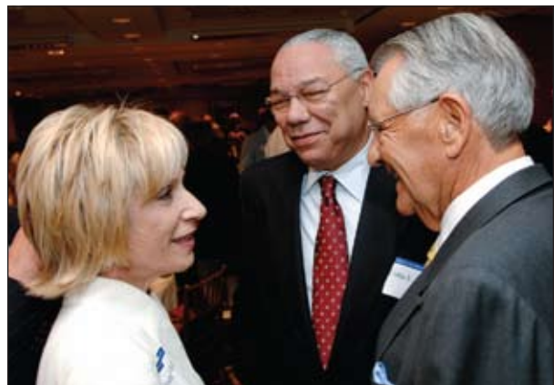
Council member Andrea Mitchell and Board member Colin L. Powell with Pete Peterson.