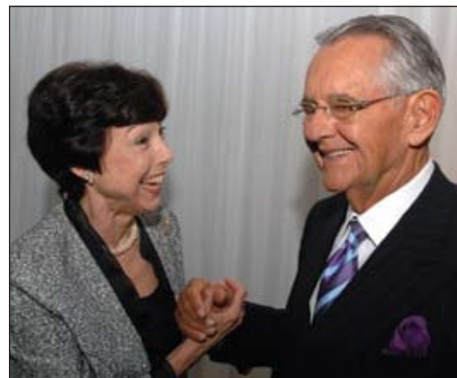
Council Co-Chairman Carla A. Hills with Pete Peterson.