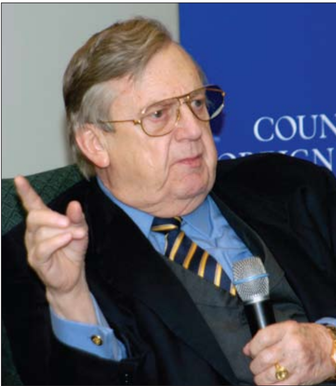
Iraq Study Group member and former secretary of state Lawrence S. Eagleburger discusses the study group's findings after the release of its report.

now part of the Iraq “brain trust” advising General David H. Petraeus; and Peter Beinart , former editor of the New Republic and now a Council senior fellow.