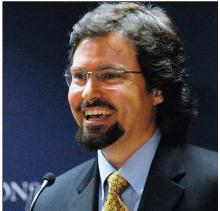
Sheikh Hamza Yusuf discusses Islam in America as part of the Nexus of Religion and Foreign Policy series.

Shepherd, an early regional governor of the District of Columbia, is just a block from the Old Executive Office Building, diagonally across from the World Bank, and five blocks from the State Department. The newly renovated building will provide an even more vibrant and convenient place for Council members to interact with one another and with the foreign policy community at large.