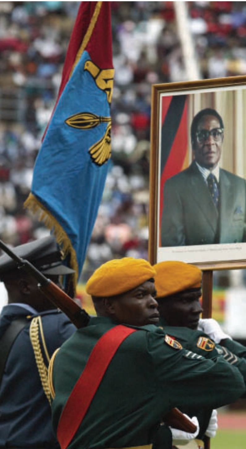
Members of a Zimbabwean honor guard with a portrait of President Robert Mugabe during Independence Day celebrations in Harare.