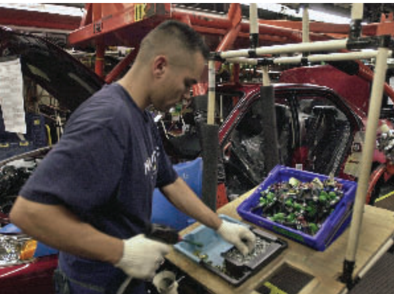
Left: An assembly line worker in Fremont, California.