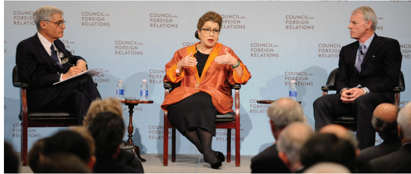
Robert Rubin, Carmen Reinhart, and Michael Spence at the 2011 Corporate Conference