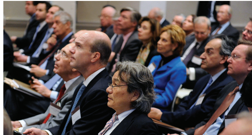
Members attend a session of the annual Corporate Conference