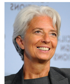
Left: Managing Director of the International Monetary Fund Christine Lagarde speaks at CFR's offices in New York. Right: General Electric's chairman of the board and chief executive officer Jeffrey Immelt and CNBC's Maria Bartiromo at the 2011 Corporate Conference.