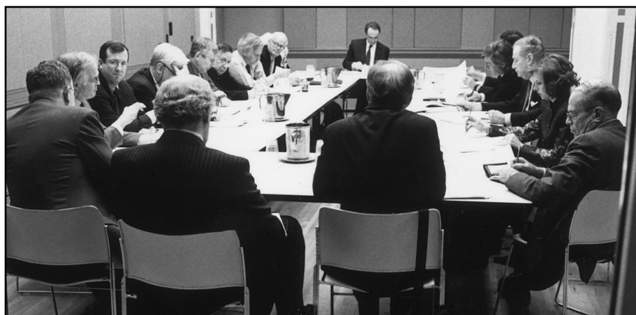
Participants at the April 4, 2002, Roundtable on Corporate Governance, "Conclusions and Recommendations."