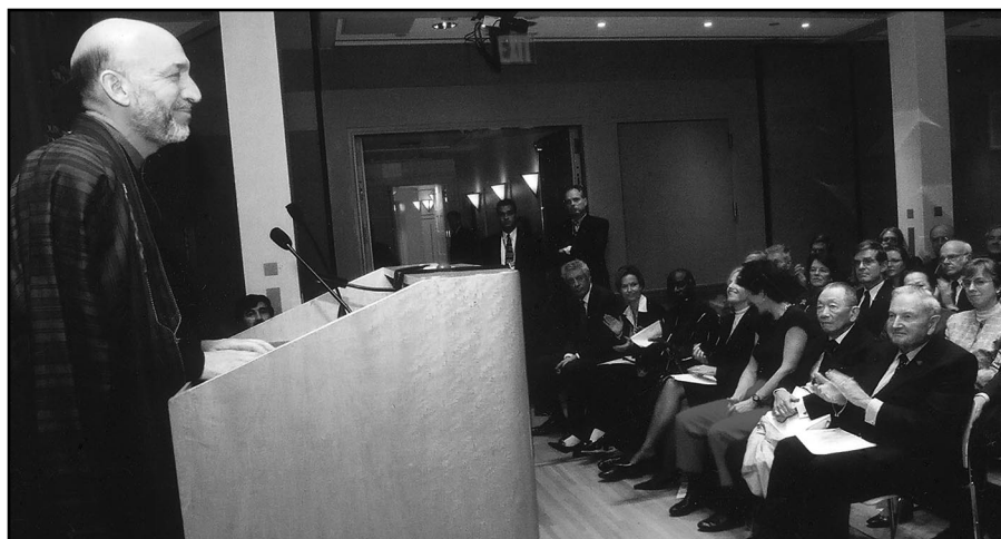
Speaker Hamid Karzai, Chairman, Afghan Interim Authority, at the January 30, 2002, "Meeting with Hamid Karzai."