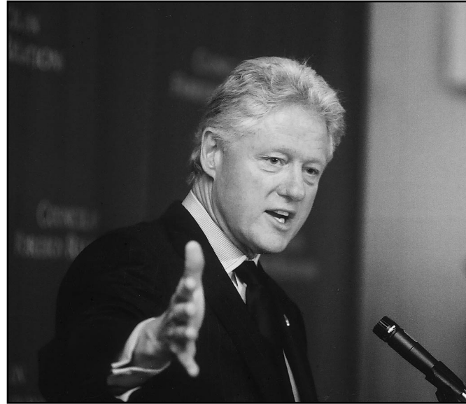
Speaker William Jefferson Clinton, 42nd President of the United States, at the June 17, 2002, Meeting, “Our Shared Future: Globalization in the 21st Century.”

*Meeting endowed by the Thomas J. Watson Foundation.