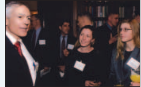
General Wesley Clark with Term Members at the Term Member Conference.

Council Policy Initiatives (CPIs) are designed to foster public debate by making the best case for two or more alternative views on a critical foreign policy issue. These arguments are published in the form of policy memos or presidential speeches. A recent CPI presented three different perspectives on the Bush administration’s National Security Strategy.