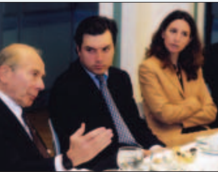
Maurice R. Greenberg with Council Term Members.