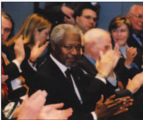
UN Secretary General Kofi Annan.