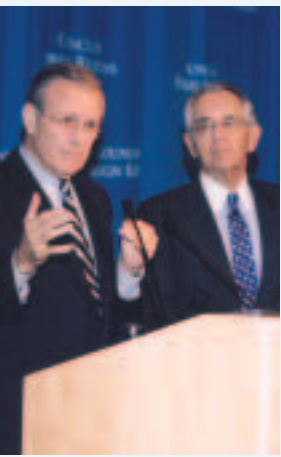
Secretary of Defense Donald H. Rumsfeld with Council Chairman Peter G. Peterson.

The Council's 4,200 members are American citizens who were nominated and seconded by other members for election by the Board of Directors. Approximately one-third live in the New York area, one-third in and around Washington, and one-third across the rest of the country and overseas. Of these, some 550 younger (or Term) members between the ages of 28 and 36 are elected to five-year terms. Term members are subsequently eligible for election to life membership.