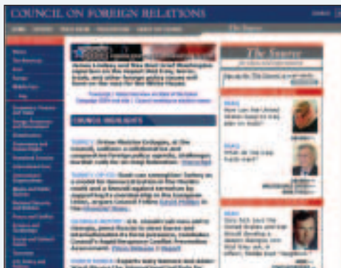
The Council's website at www.cfr.org .

Books written by fellows are published by leading commercial and university presses. The Council on Foreign Relations Press publishes Council-sponsored Independent Task Force reports and other policy papers. For a list of publications, as well as the full text of many of them, visit the Council's website at www.cfr.org .