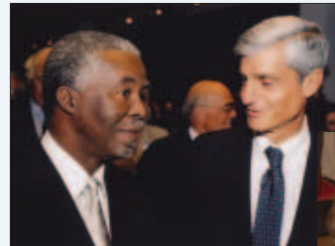
South Africa's President Thabo Mbeki with Council Vice Chairman Robert E. Rubin.