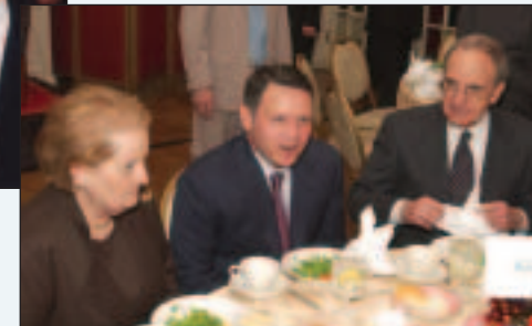
King Abdullah of Jordan (middle) with former Secretary of State Madeleine K. Albright and former Senator George J. Mitchell.