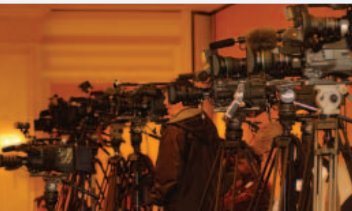
Forty percent of meetings are on the record and open to the press.

One of the Council's principal goals is to help inform the country's foreign policy debate and to provide citizens with reliable, accessible, nonpartisan information and background. Council fellows contribute their expertise to major print, broadcasts, and online news media outlets through interviews, articles, op-eds, and commentaries. Books written by fellows are published by leading commercial and university presses. The Council on Foreign Relations Press publishes Council-sponsored Independent Task Force reports and other policy papers. For a list of publications, as well as the full text of many of them, visit the Council's website at www.cfr.org .