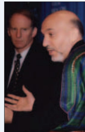
Council President Richard N. Haass with Afghanistan's President Hamid Karzai.

While most Council programs are not for attribution, in an effort to reach a broader audience the Council has increasingly opened meetings to journalists and posted transcripts from meetings on its website — www.cfr.org .