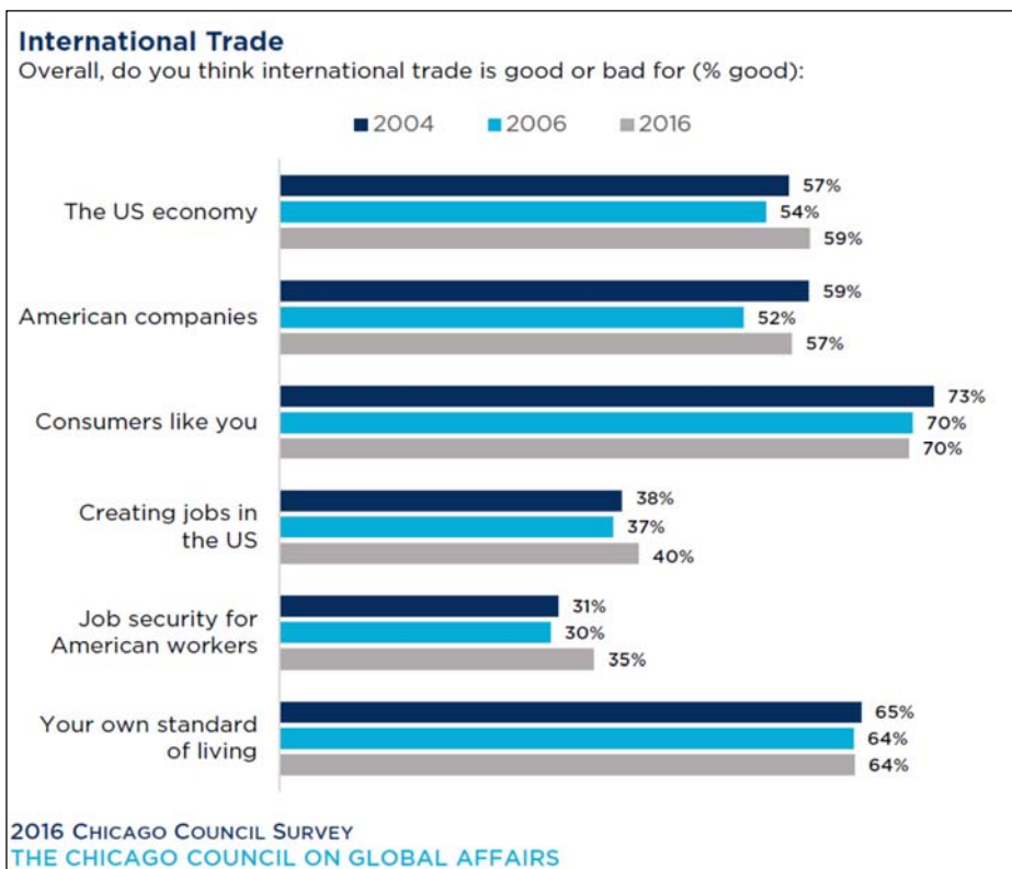
Figure 1. Perception of International Trade Among Americans